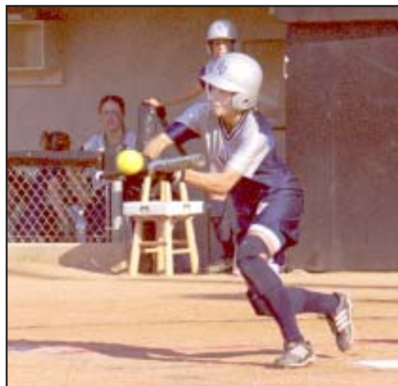
Moving The Runners

If the umpires have any doubt regarding the legality of any combination, the umpires shall require the head coach to provide written documentation verifying the legality of that combination in question. The written verification shall include a statement indicating the individually manufactured components of the combination have been tested and certified together as called for in the standard. Any helmet and mask combination that has been manufactured together as a single unit (hockey style helmets) and has been certified to meet the NOCSAE standard will have their stamp on it. Umpires can then tell if it is a legal helmet by the identifying stamp. The stamp is depicted in the 2003 NFHS Baseball Rules Book and the NFHS Web site.