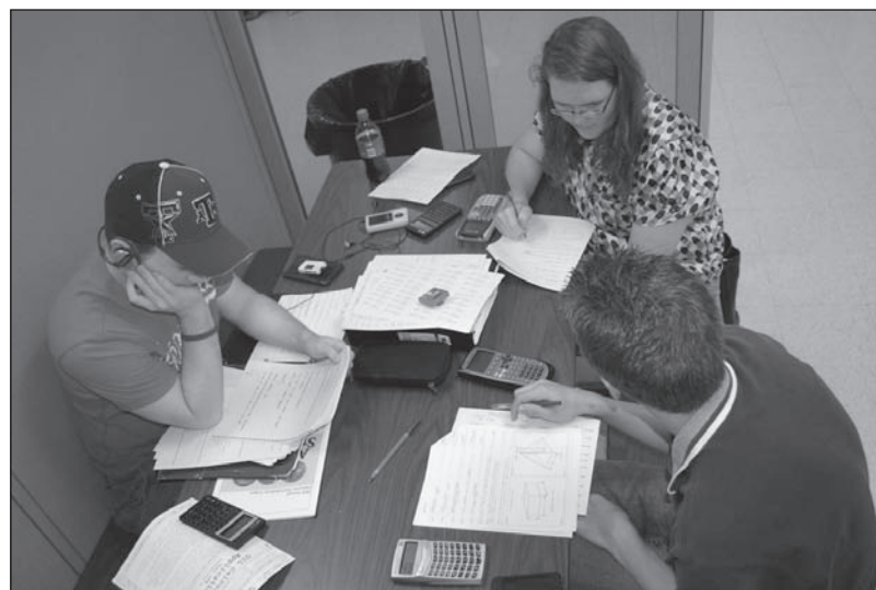
(Above) The Azle Calculator Applications' team prepares for the contest. The team placed fourth. (Right) State competitors from La Joya enjoy the beautiful day while waiting for results.