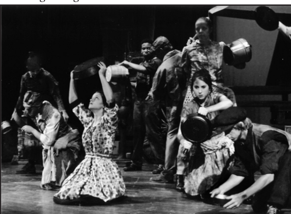
3A - Mexia High School

to experience a disqualification of a cast due to an error on your part is not a pleasant experience for any of the parties involved. Take time this summer to review. It'll make for a more pleasant journey in 2009.