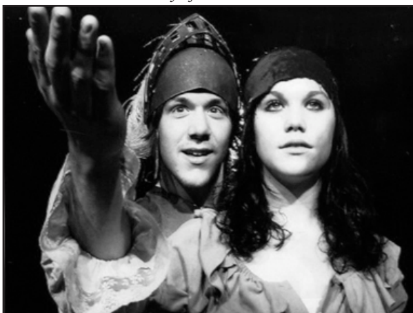
2A - Rogers High School