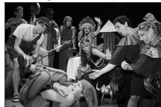
5A - Mansfield High School