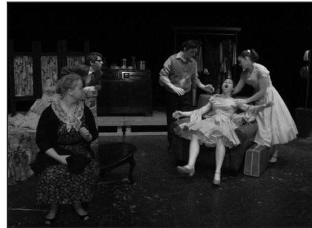
4A - Clemens High School