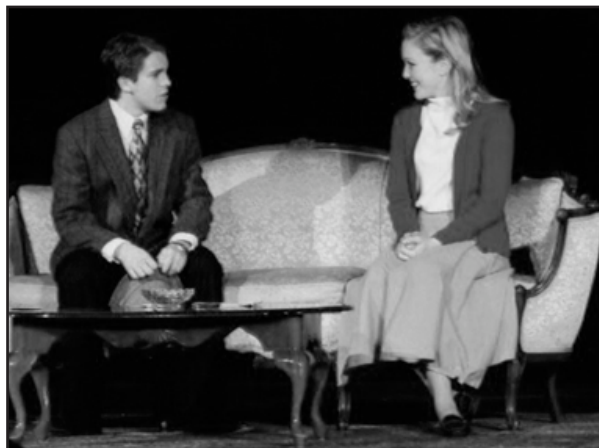
1A - Fort Worth Academy of Fine Arts