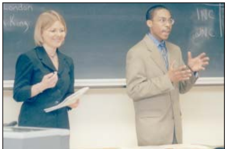
The Debate Continues!