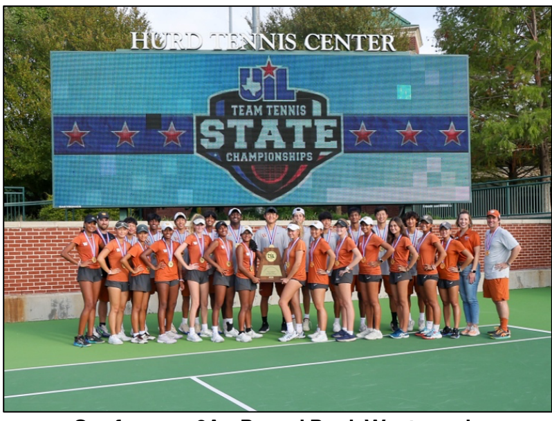
Conference 6A – Round Rock Westwood