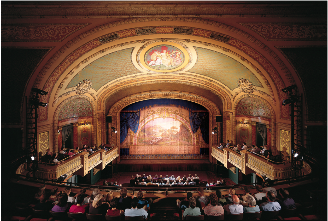
The Interior of The Paramount Theatre