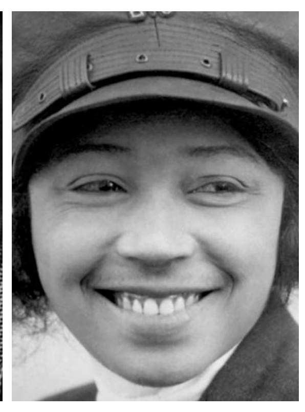
Why should you enter?