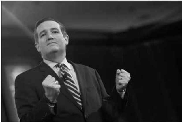
Senator Ted Cruz (R-Texas) speaks at the 2015 Conservative Political Action Conference in National Harbor, Maryland.