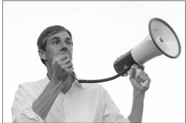
U.S. Senate candidate Beto O'Rourke speaks at a rally in Kiwanis Park in Wichita Falls, Oct. 29, 2018.

DO NOT TURN THIS PAGE UNTIL YOU ARE INSTRUCTED TO DO SO!