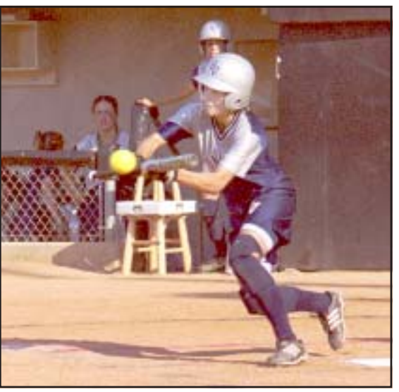
Moving The Runners

A: The ASA made announcements on July 31, 2002,