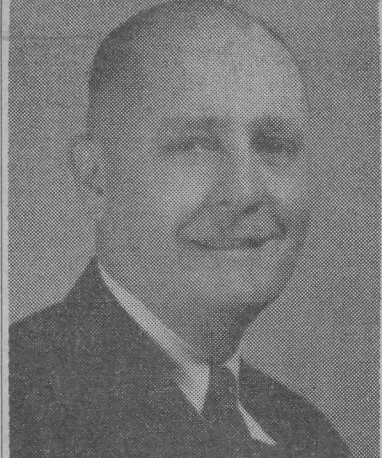
High School, El Paso. Biographical information