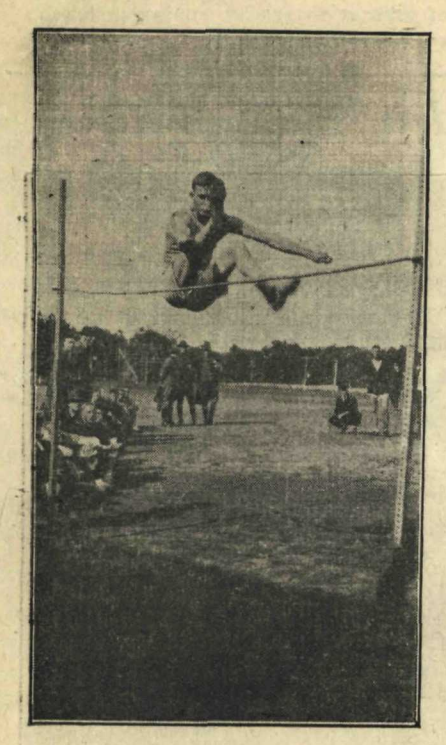
C Larson Gives Exhibition at State

WORLD'S CHAMPION HIGH JUMPER GIVES EXHIBITION the following letter: