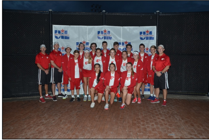
Fredericksburg 4A State Champions