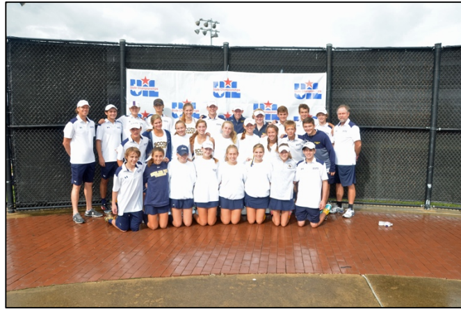
Dallas Highland Park 5A State Champions