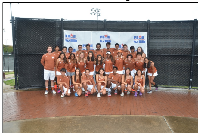
Round Rock Westwood 6A State Champions