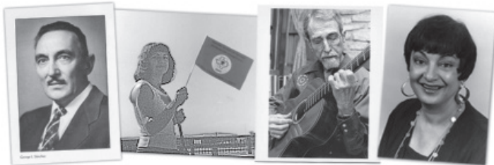
Photos of George I. Sánchez, Gloria Anzaldúa, and Américo Paredes are courtesy of the Nettie Benson Latin American Collection at The University of Texas at Austin. Photo of Irma Rangel courtesy of The South Texas Archives, Texas A&M University - Kingsville.